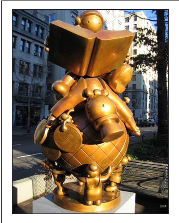
EDUCATING THE RICH ON THE GLOBE Sculpture by Todd Otterness ~ 1997 Upper Broadway ~ New York, NY USA

CELEBRATING THE BEAUTY & TRADITION OF SACRED ART