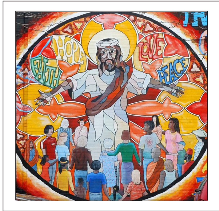
RACE AND RECONCILIATION MURAL

CELEBRATING THE BEAUTY & TRADITION OF SACRED ART