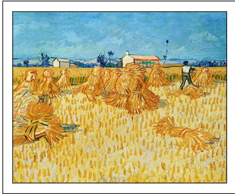
HARVEST IN PROVENCE

CELEBRATING THE BEAUTY & TRADITION OF SACRED ART