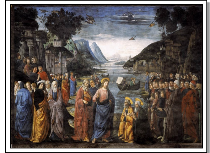
CALLING OF THE APOSTLES Fresco painting by Domenico Ghirlandaio ~ 1481 Sistine Chapel, The Vatican ~ Vatican City

EXPLORING THE BEAUTY & TRADITION OF SACRED ART