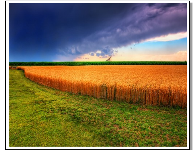
KANSAS SUMMER WHEAT AND STORM PANORAMA Photograph by James Watkins ~ 2010 Kansas, USA

EXPLORING THE BEAUTY & TRADITION OF SACRED ART