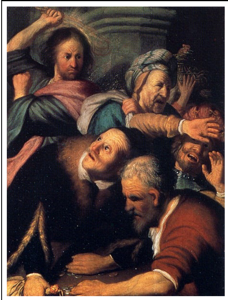
CHRIST DRIVING THE MONEY CHANGERS FROM THE TEMPLE

EXPLORING THE BEAUTY & TRADITION OF SACRED ART