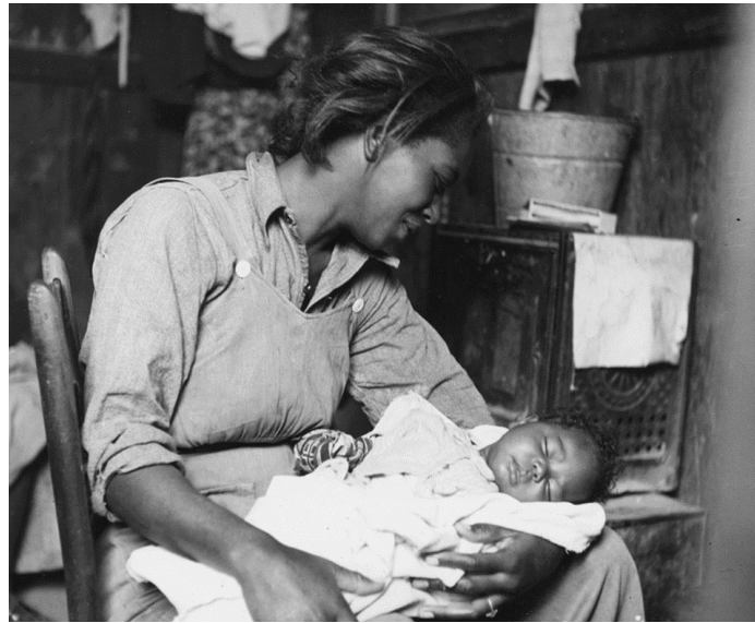
MIGRANT COTTON PICKER AND HER BABY

CELEBRATING THE BEAUTY & TRADITION OF SACRED ART